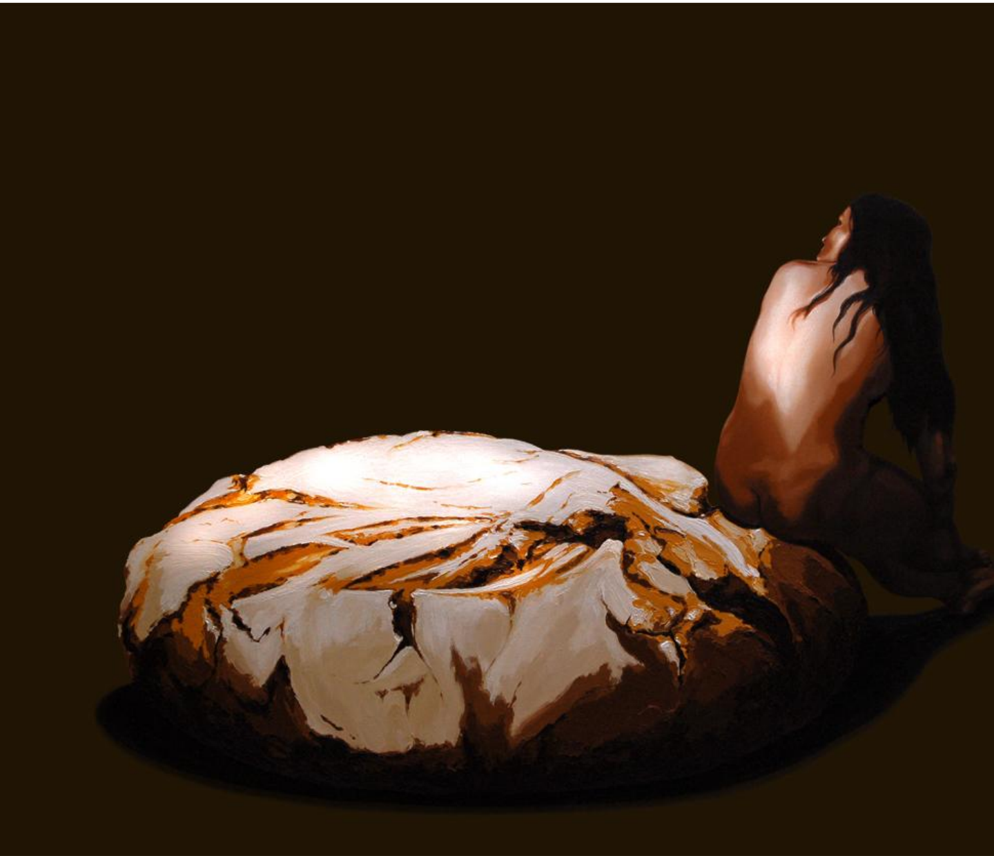
Urban Grünfelder, N. T. 2021.