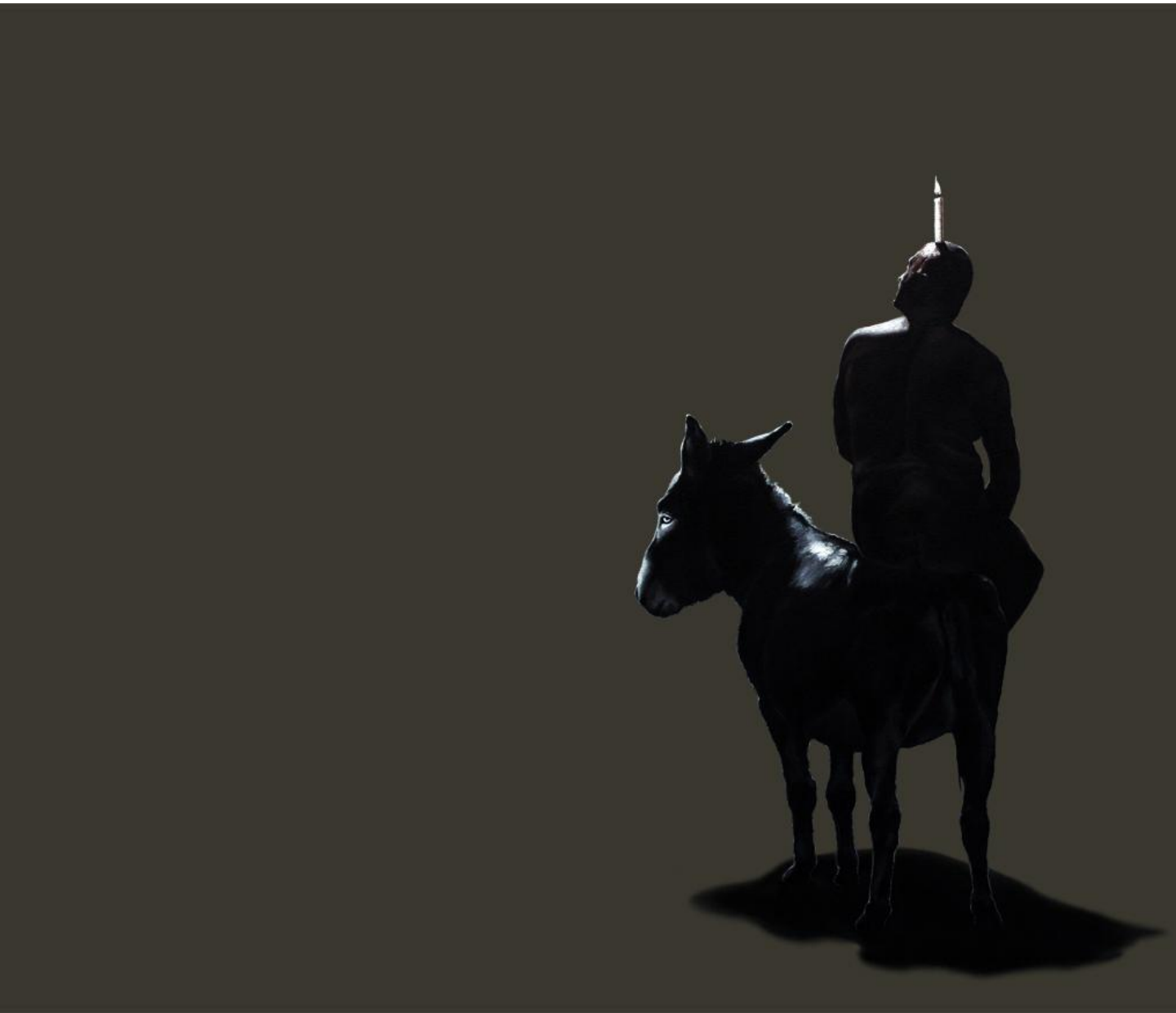
Urban Grünfelder, The gaze of the philosopher , 2020.